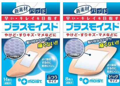
【size : regular】